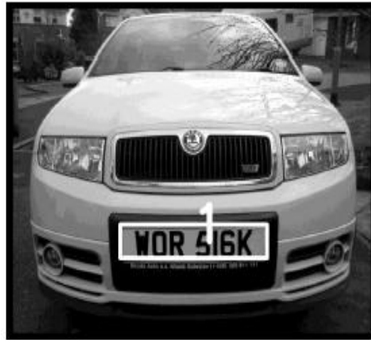
Fig Contour Detection of Car