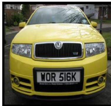
Fig Input car image

In this stage the license plate region from the given image is located and isolated. Quality of the image plays an important part hence prior to this stage preprocessing of the image is necessary. Preprocessing of the image includes conversion of the colored image into gray scale followed by histogram equalization which enhances the contrast of the image. Below is the original car image (RGB) and its gray scale image.