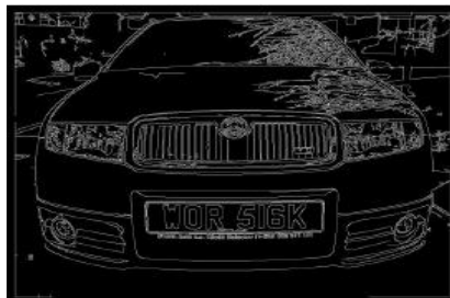
Fig Canny Edge image of Car

The result of the canny edge detection on the gray scale images are shown below: