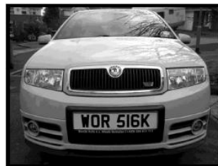
Fig Gray scale image for Car

After this stage the primary process of license plate extraction is carried out.